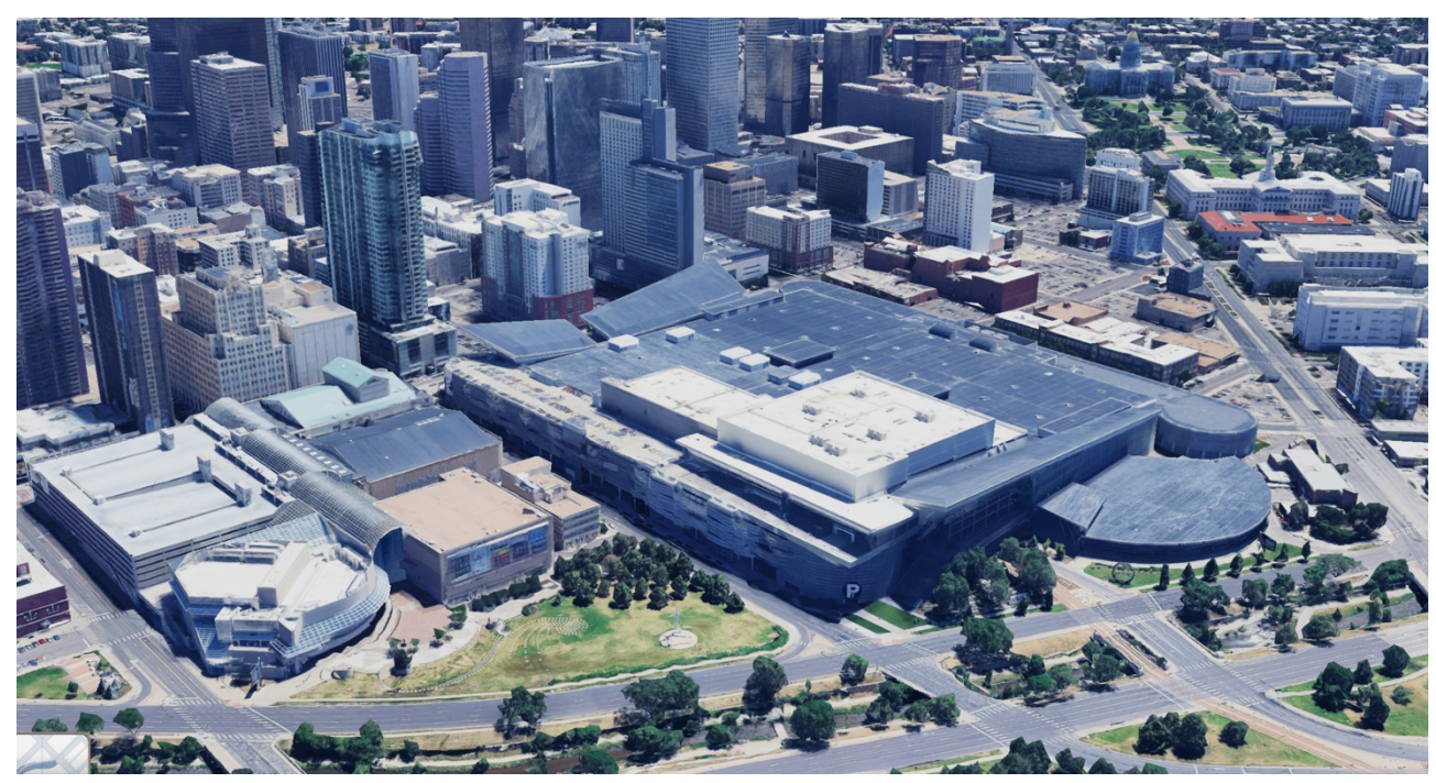
Hyatt Regency Denver at Colorado Convention Center 650 15th St, Denver, CO 80202