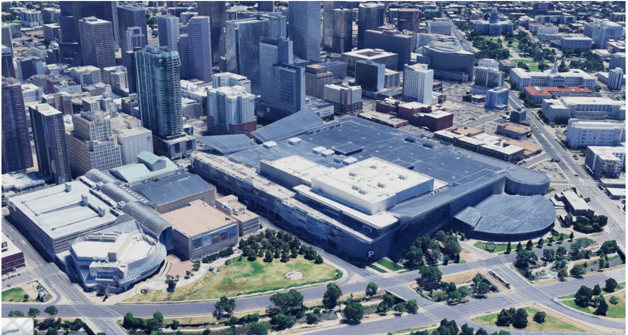
Hyatt Regency Denver at Colorado Convention Center