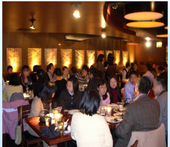
Conference dinner banquet

Every year CAERDA welcomes new members and reunites old acquaintances at the annual conference dinner banquet. We gather to catch up with one another, make new friends, and join or renew membership with CAERDA, while enjoying good Chinese food at a discount. This year, the dinner banquet was held at P.F. Chang's Bistro in downtown Chicago on April 8. The dinner was well attended by CAERDA members, their family members and friends.