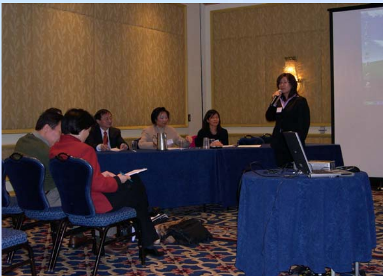
Presidential Panel I session