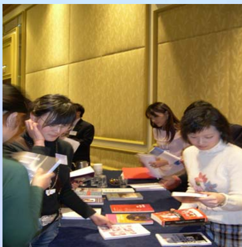
Conference book display and give-away